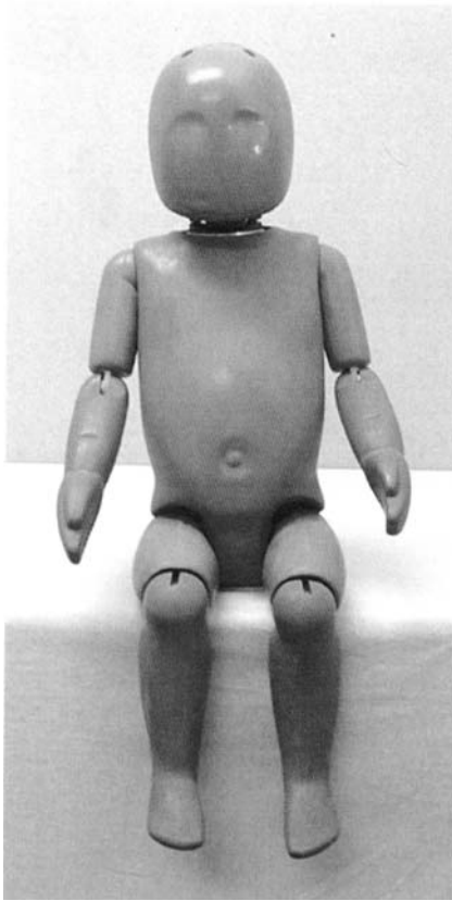
FIG. 1 CRABI 12 Dummy