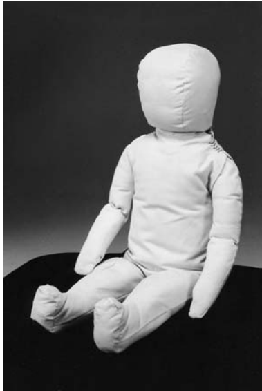
FIG. 1 CAMI Infant Dummy, Mark II